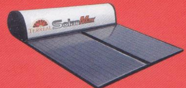
SolarMax™ Solar Water Heater