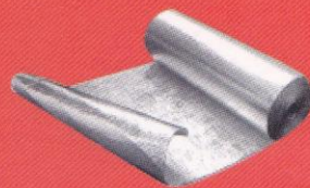
CoolMax™ Thermal Reflective Insulation